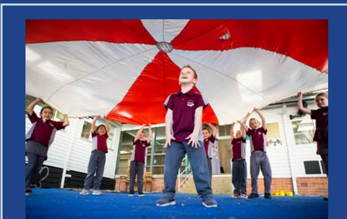
Total enrolments of 3 year olds in preschool in regional areas has shown decline<sup>1</sup>.