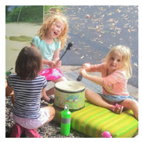
Children have social and emotional skills appropriate for their age