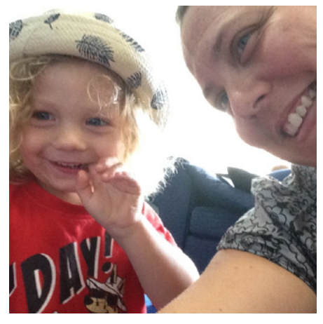
Parents are confident, connected to their community and its services and equipped to support their children's development