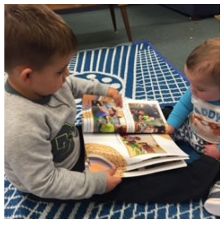
Children have literacy and numeracy skills appropriate for their age