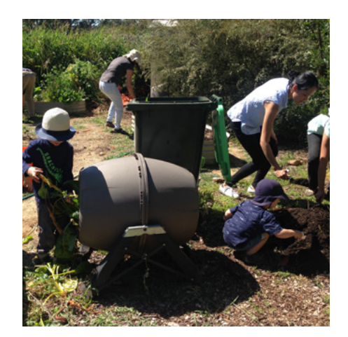
Children are physically well and healthy

Results-based accountability has been used as the framework for the development of outcomes and performance measures.